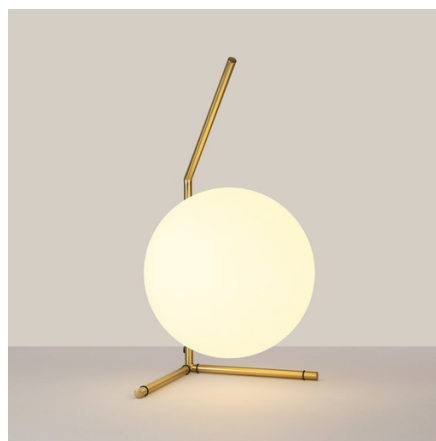
Table lamp "OCTO 220", refined and modern, featuring a spherical shade of 22 cm in diameter made of opaline glass. With simple lines and a minimalist character, it offers great versatility in decoration, adapting to both classic or retro interiors as well as contemporary styles. It can be used as a desk lamp, for a side table in the living room, or in hallways. ** Accepts E27 bulb - NOT included**