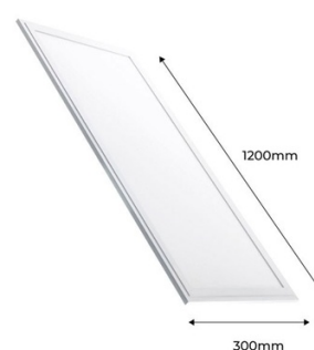
⇌ Driver Philips 123x43mm

PACK x 2 Recessed LED Panels 120X30 cm - Philips Driver Elegant and ultra-thin panels with advanced technology for powerful and even lighting in three shades of white (3000K, 4000K, 6000K). They have a power of 44W and a luminous flux of 2900 lumens. Ideal for offices, conference rooms, schools, or hospitals. High Color Rendering Index (CRI>80) for accurate color reproduction and low glare index (UGR≤19). They can be mounted on false ceilings or recessed in drywall with an embedded frame (not included).