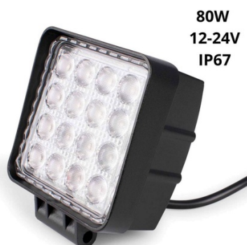
80W 12-24V IP67