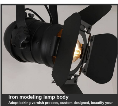
Adopt baking varnish process, c